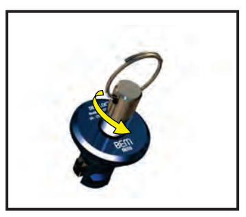
Turn the Secure Key counterclockwise until it stops.