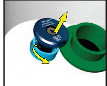
Remove the cap from the filler neck by screwing unit counter clockwise and pulling up.

Lightly tightening the Secure Screw is enough to ensure a secure system and an easy-to-unlock cap for the future.