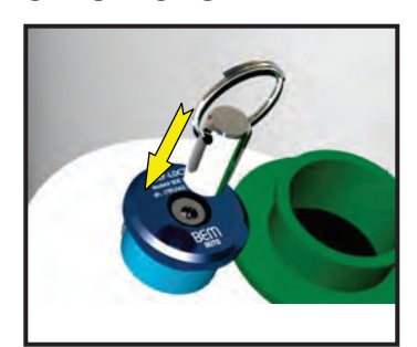
Align the Secure Key over the screw head and slip it on.