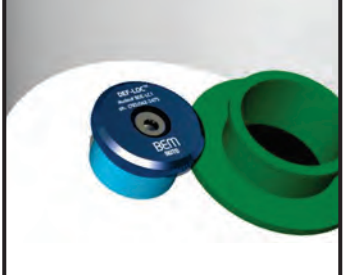
Remove the Secure Key.