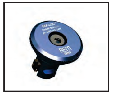
Remove Secure Key. Locking Ward will be fully up in its retracted position.