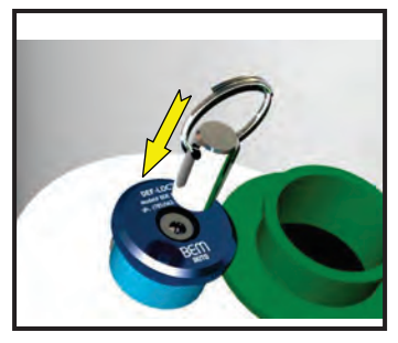
Align the Secure Key over the screw head and slip it on.