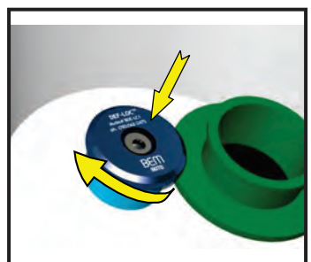
Slide unit in filler neck and turn clockwise until it stops.