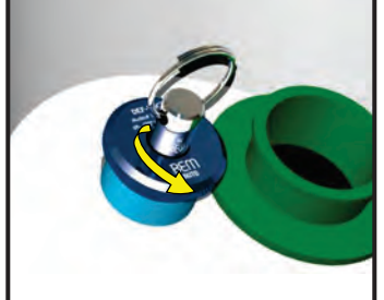
Turn the Secure Key counterclockwise until it stops. Again, do not overtorque the key. It will break/twist off the c-clip.