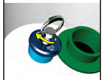
Turn the Secure Key clockwise until the screw is LIGHTLY tight.