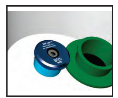
Remove Secure Key. Unit will be secured.

Yes, we're shouting "LIGHTLY." If you overtwist the key it will break/twist off the small c-clip that holds the lock in place.